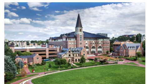
University of Denver (USA)