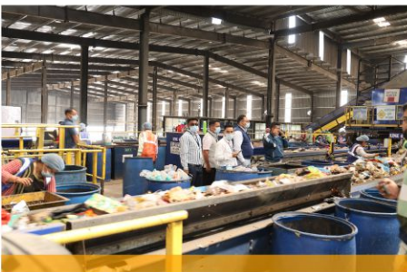
Field visit to Indore Municipal Corporation (IMC)

This structured approach guides ANVESHAN's mission in contributing to a cleaner, healthier India.