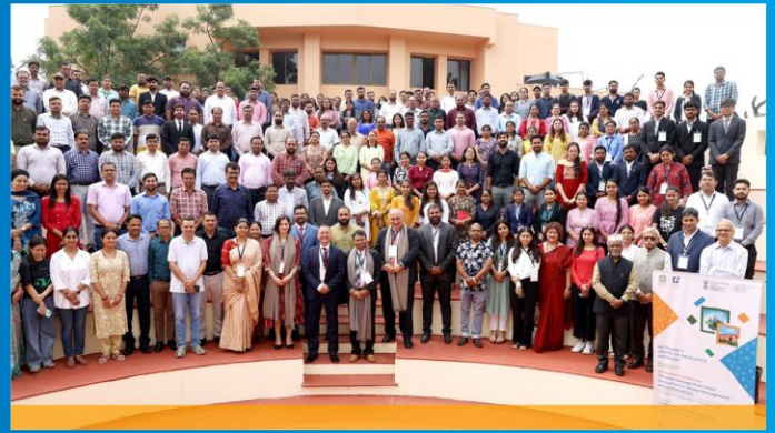
International Conference on Garbage-Free Cities

By engaging with leading experts, academic institutions, and industry leaders from across the world, we aim to create a platform for knowledge exchange and cross-border collaboration. We aim to publish high-quality research papers, reports, and case studies that are widely recognized and cited in the global academic and policy-making community. This contributes to our larger mission of influencing policy changes, shaping the future of waste management strategies, and promoting a culture of sustainability at both national and international levels.