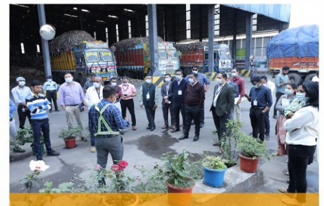
Briefing to participants during IMC field visit

We also actively collaborate with international partners to enhance the quality and reach of our research and publications. Our objective in strengthening these global partnerships is to bring diverse perspectives, advanced methodologies, and innovative solutions to the critical issues of urban waste management, sustainability, and environmental conservation.