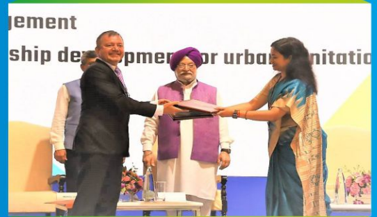
Announcement of Centre of Excellence at New Delhi

The CoE facility at IIM Indore is a state-of-the-art complex that promotes collaboration, innovation, and advanced learning experiences, featuring modern studios equipped with cutting-edge tools.