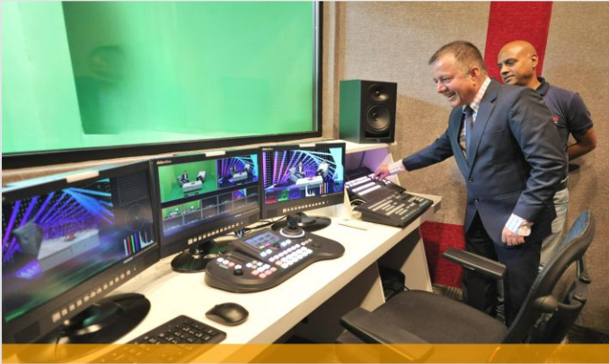
ANVESHAN Studios (Synchronous and Asynchronous)

ANVESHAN, the Centre of Excellence (CoE) at IIM Indore, envisions becoming a hub for leadership and administrative training under the ambit of Swachh Bharat Mission (SBM) 2.0. The centre aspires to offer specialized full-time and part-time programmes focusing on public policy, urban governance, and change management, catering to administrators, managerial and executive cadres, as well as front-line employees of corporations and local bodies. The centre seeks to act as a bridge connecting municipal corporations, local bodies, businesses, and service organizations, with a focus on addressing key challenges in waste management and WASH (Water, Sanitation, and Hygiene). Through a holistic approach encompassing training, research, and behavioral change initiatives, ANVESHAN strives to contribute meaningfully to enhancing cleanliness, waste management, and hygiene standards across India.