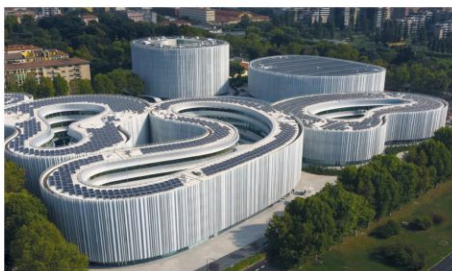
Bocconi University in Milan (Italy)

ANVESHAN's global partnerships signify a progressive step toward creating a sustainable future through advanced waste management solutions. By joining hands with esteemed institutions like the University of Denver, Rutgers University, the University of Glasgow, the University of Liverpool, and Bocconi University, ANVESHAN taps into a wealth of international knowledge, research, and technological expertise. This cross-border synergy ultimately aims to inspire scalable solutions that can be adapted globally, turning waste into wealth while strengthening environmental stewardship.