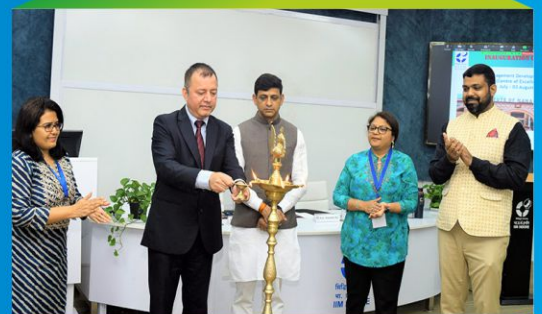
Inauguration of the ANVESHAN's First Cohort