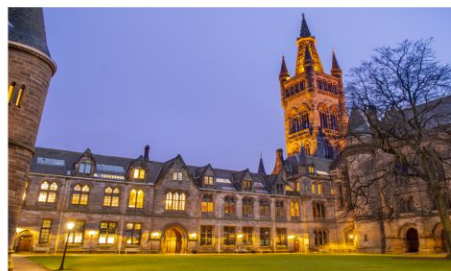
University of Glasgow in Scotland (UK)