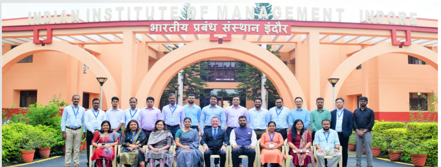
First Batch of Customized Management Development Programme for ANVESHAN

Core areas of focus include Capacity Building Programmes for senior urban officials across India, aimed at enhancing their capabilities in managing urban challenges for a sustainable environment. ANVESHAN has also developed a best practices repository in partnership with international experts, offering toolkits, compendiums, and guidelines to bridge knowledge gaps in sanitation and waste management. Additionally, its state-of-the-art facility, equipped with advanced studios, facilitates high-quality educational programmes and online learning, ensuring robust and accessible training for urban leaders across the country.