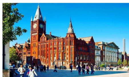
University of Liverpool (UK)